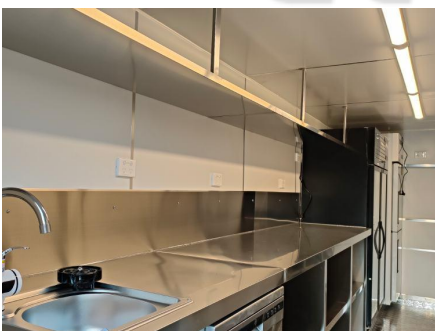
- Kitchen Equipment -