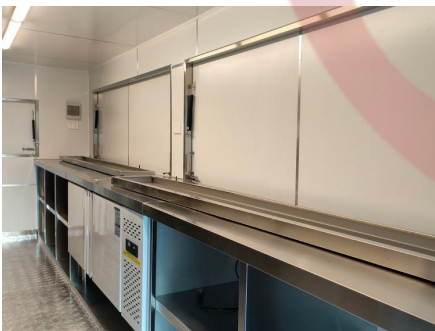
- Inside -