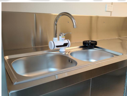
- Sink -