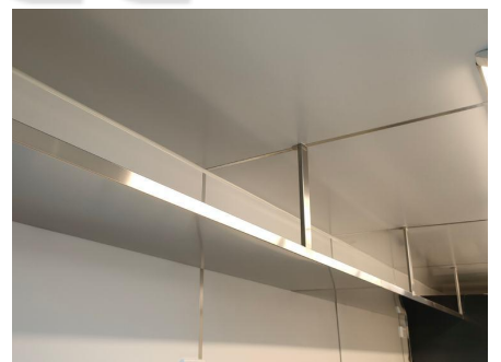
- Shelf -