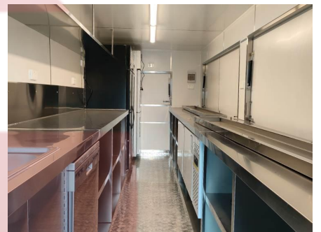
- Inside -