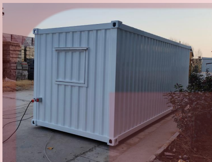
- Electrical Hookup -