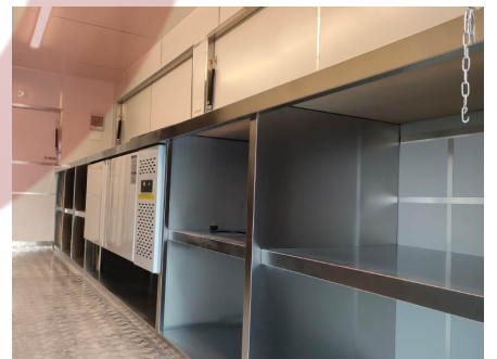
- Cabinet -